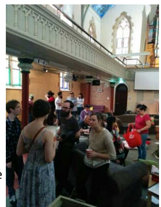
Mission Night Launch Oct 9