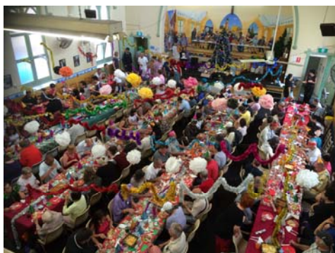
Christmas Day 2015 community lunch.