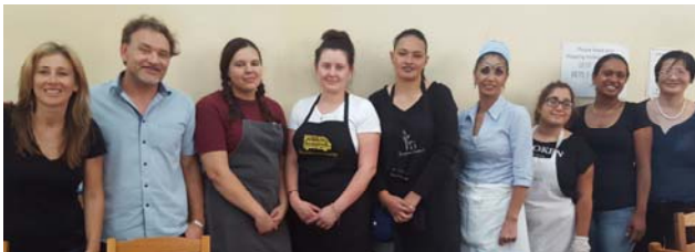
TAFE student groups learning and working together at the Jordan Cafe

Our belief is that God's plan is for all to come to know Him and for all lives to be restored. Every program and every deed is based on this assurance of hope and the love of God towards His people. Everything we do is for the benefit of each individual and every effort is not hopeless but hope-filled in Christ.