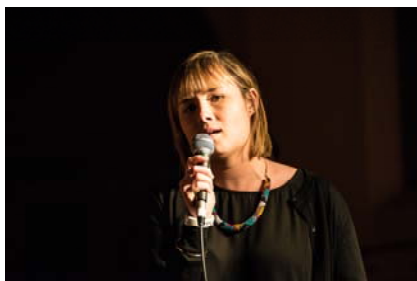
Creative Conversations 2016

Artists Collective This year we intentionally brought together our ACAC Coop and ACAC Members together into one Artists Collective so that ACAC itself operates as a shared project. It's still early days in establishing how the Collective operates together. But already there have been significant interactions over shared values and vision to invest in an alternative culture around arts practise.